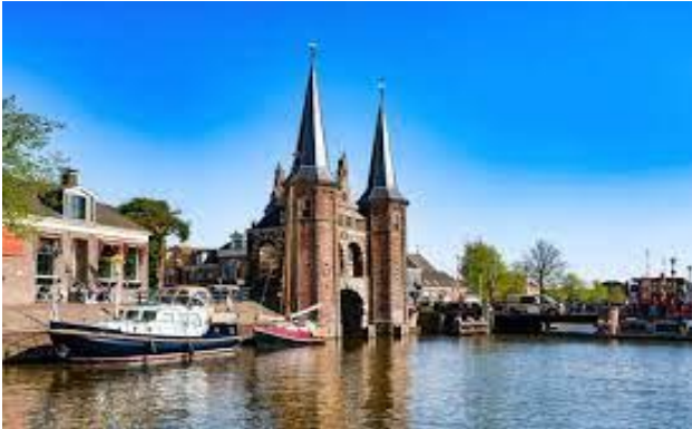
The town of Sneek Friesland